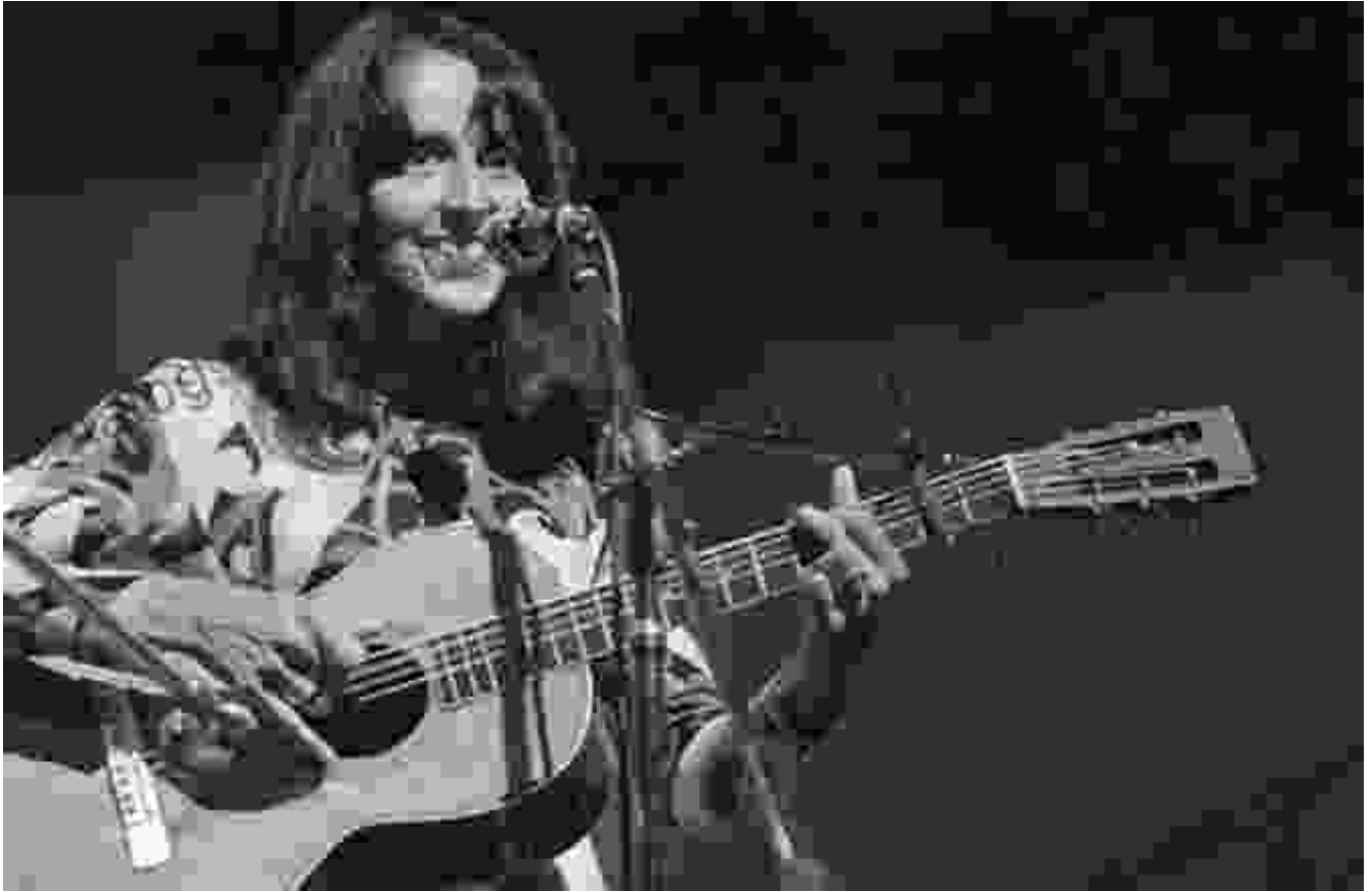
Joan Baez performing at the Newport Folk Festival in 1965