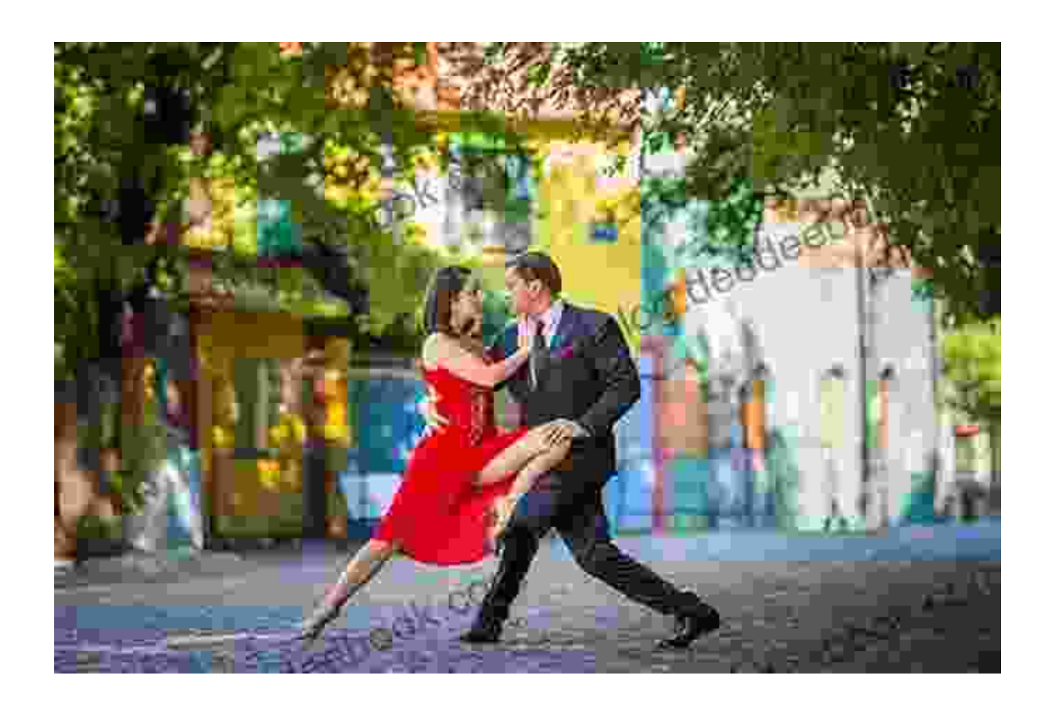
A milonga, or traditional tango dance venue, in Buenos Aires, Argentina.

Beyond its cultural significance, tango also plays an important social role in Buenos Aires. Milongas provide a welcoming and inclusive space for people of all ages and backgrounds to come together and connect through the shared experience of dance. Tango is a way of life for many Argentinians, offering a sense of community and a release from the stresses of everyday life.